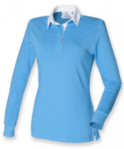
SURF BLUE / WHITE