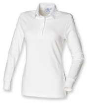
WHITE / WHITE