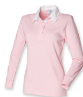
LIGHT PINK/ WHITE